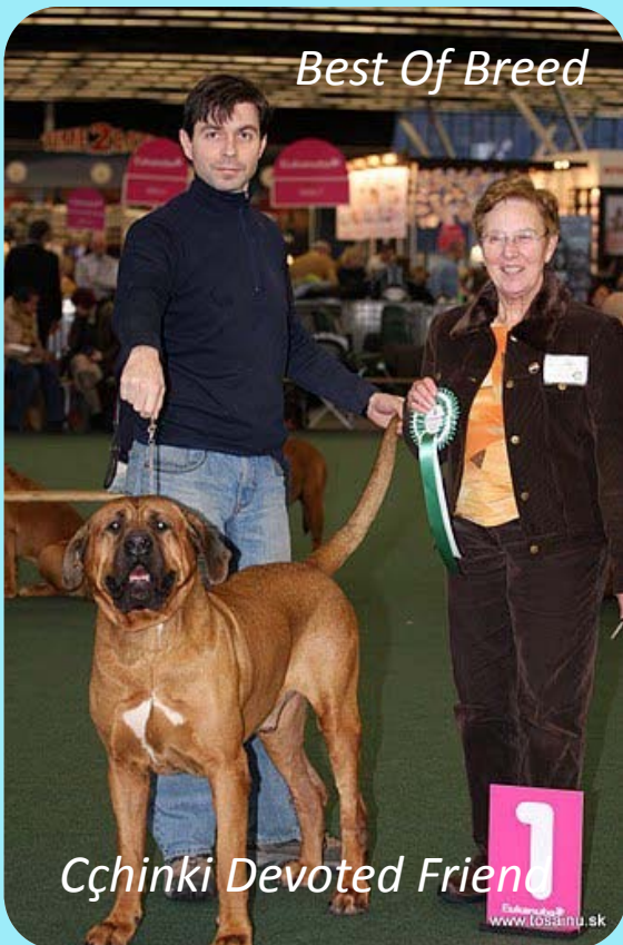
Best Of Breed