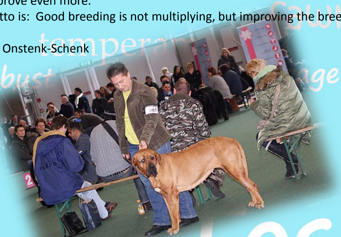
Best female, Nihon Koku's Benihime