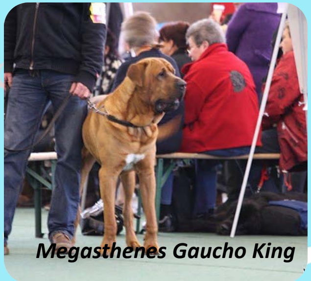
Megasthenes Gaucho King